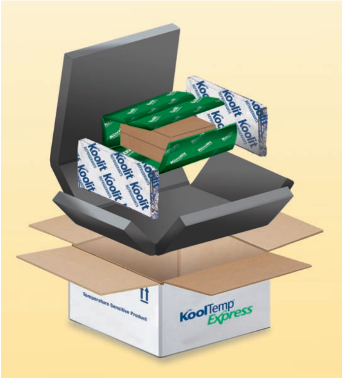
The GTS-18 shipper is easy to packout and ideal for shipping next day delivery of unit load doses.